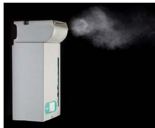
CMC humidifier with Blower Pack BP1 for room humidification

devatec reserves the right to change specifications or design of the equipment described herein without prior notice