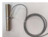
Anti-freeze device at 65°C