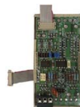
RS485 interface (option)