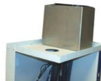
CMC humidifier fitted with filling-cup platform