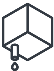
AUTO DRAIN KIT